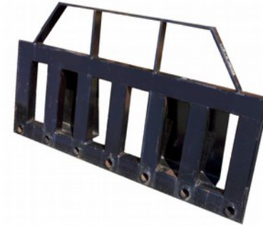
DHR Skid Steer Hay Spear (spears removed)