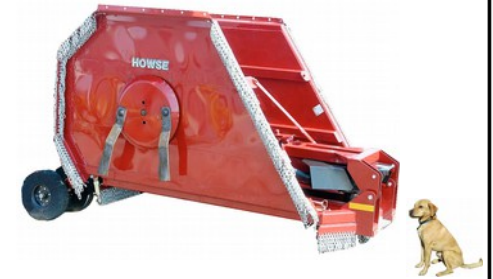
Howse Batwing 15' (wings up)