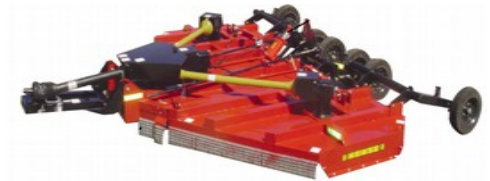
Howse 15' Batwing (wings down)

*Howse uses powder-coat paint on all its products.