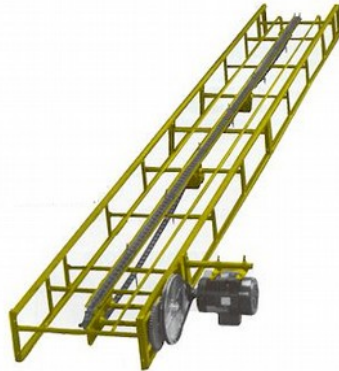
16' Bale Conveyor