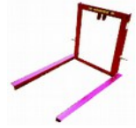
3 PT Carry All